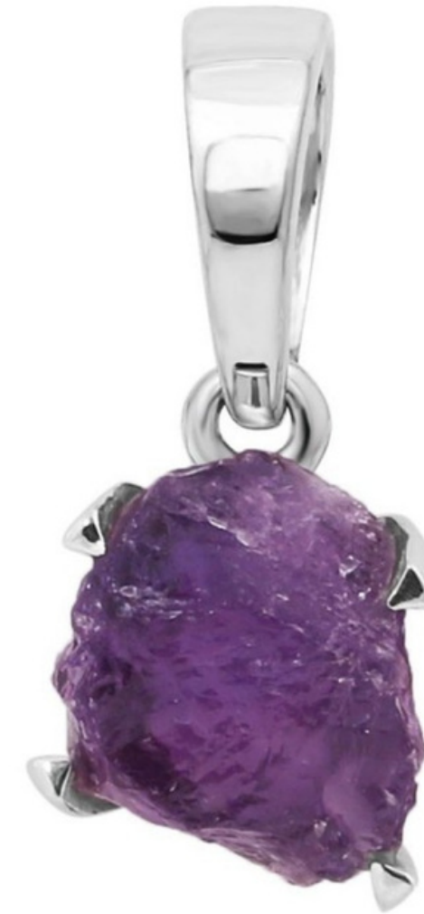
Amethyst Rough Pendant (AMT-1-5)