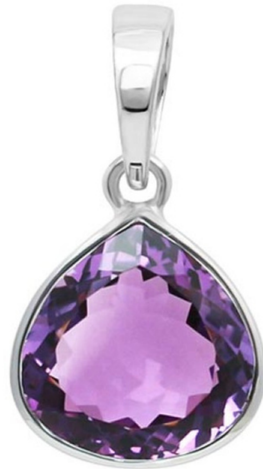
Amethyst Pendant (AMT-RDN-241)

Amethyst Lace Agate's history is intertwined with tales of serenity and balance. It's been cherished for centuries, believed to bring emotional harmony to those who wear it. Discover the legacy of this gem.