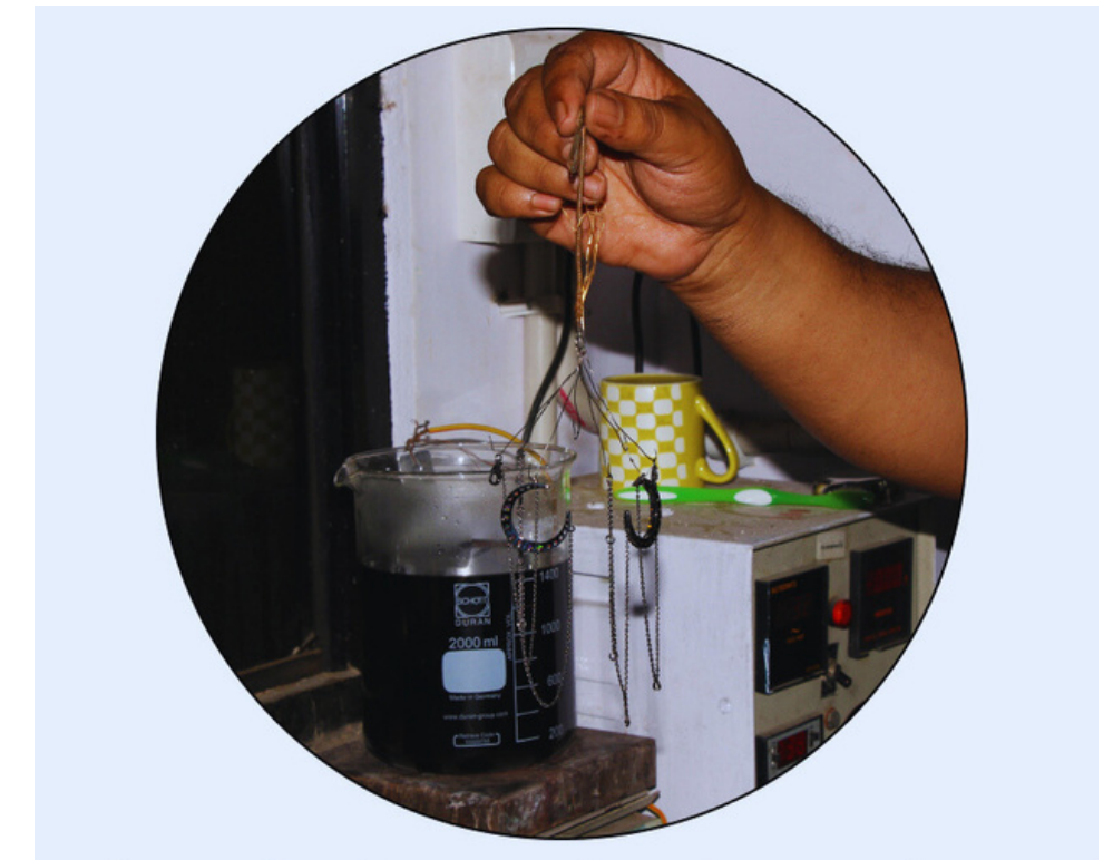
A Tale of Time