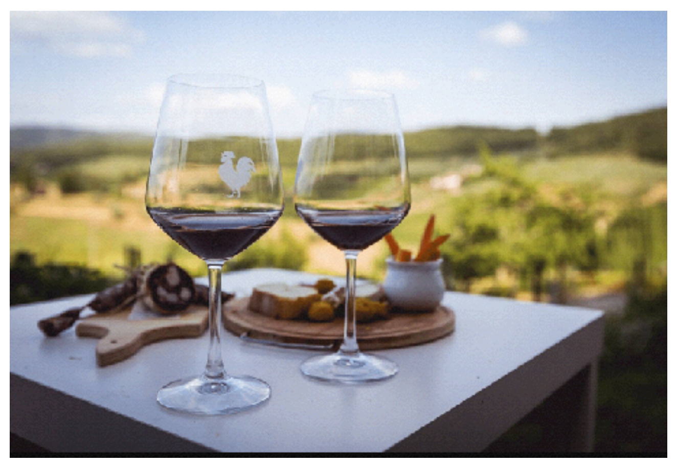
Chianti Hills and Siena Exploration

As you venture into the heart of Tuscany, the Chianti Hills and Siena Exploration tour beckons with a promise of unforgettable experiences. This tour encapsulates the essence of Tuscany, inviting you to immerse yourself in the region's rich history, stunning landscapes, and exquisite culinary traditions. Here are the highlights and practical tips to ensure a seamless journey: Tour Highlights: